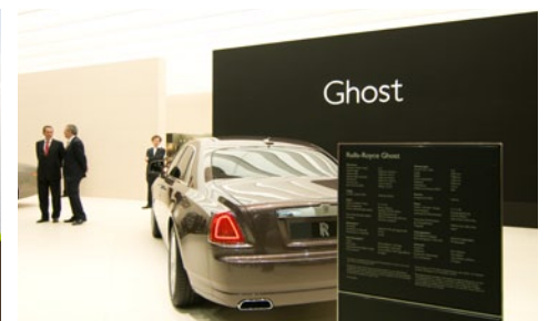
Rolls-Royce Motor Cars Trade fair design and communication