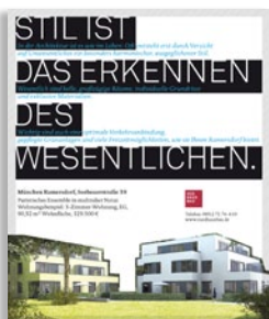
Südhausbau CI, corporate design, real estate marketing