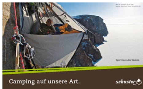
Sporthaus Schuster Lead agency since 2006