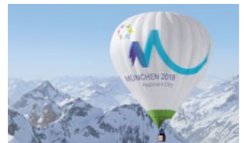
Munich's Olympic application 2018 Logo, corporate design, key visual