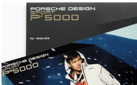
adidas Brand support Porsche Design Sport